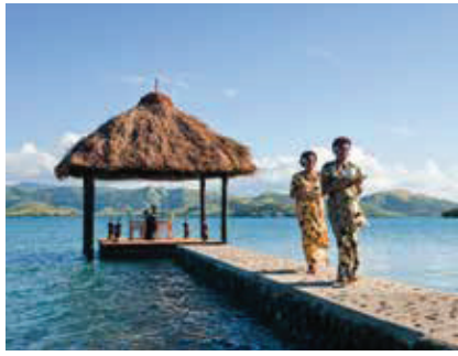
Alfresco dining on the floating pontoon