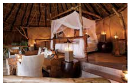
Hilltop sleep-out bure