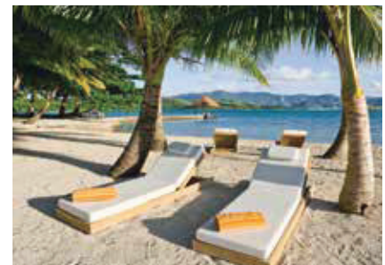
Sun beds on the sandy beach

Dolphin Island, Fiji is a sister property to Huka Lodge, New Zealand and Grande Provence Estate, South Africa. These three unique properties comprise The Huka Retreats.