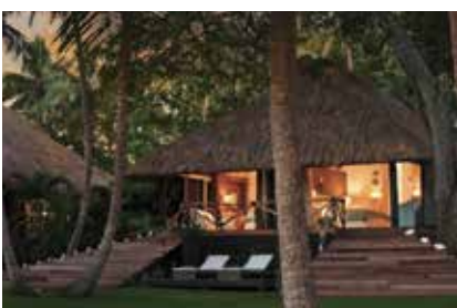
Guest bure suites