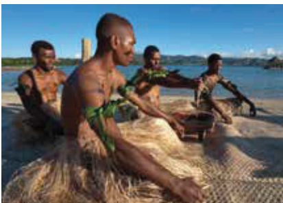
On-island traditional kava ceremony