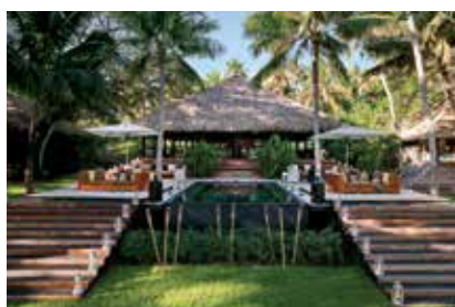
Main bure pavilion