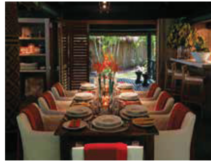
Casual/elegant dining to suit