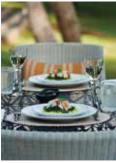
Fresh & unique flavours